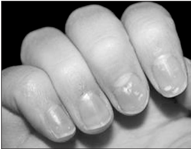
Patient with Leukodystrophy before HPU treatment