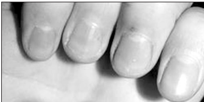
Same patient after 3 months on HPU treatment